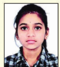
Narsingoju navya sri 20WNIR0053