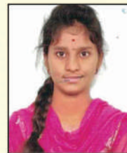
Thippavaram kavya sri 20WNIR0082