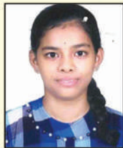
Enugurthi samatha 20WNIR0019