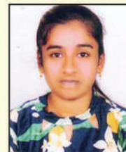
Regula srija 20WNIR0062