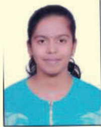
MVSL Tanmai 19WN1R0043