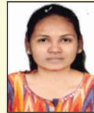
Pendota Supraja 20WNIR0058