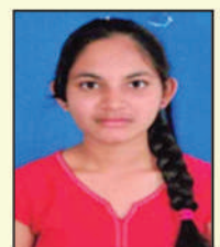
Kamera Shivani 20WNIR0036